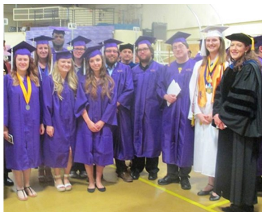
History majors at Spring 2016 Commencement